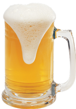
Pint of Beer